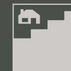
STAIRS CONTINUOUS USE