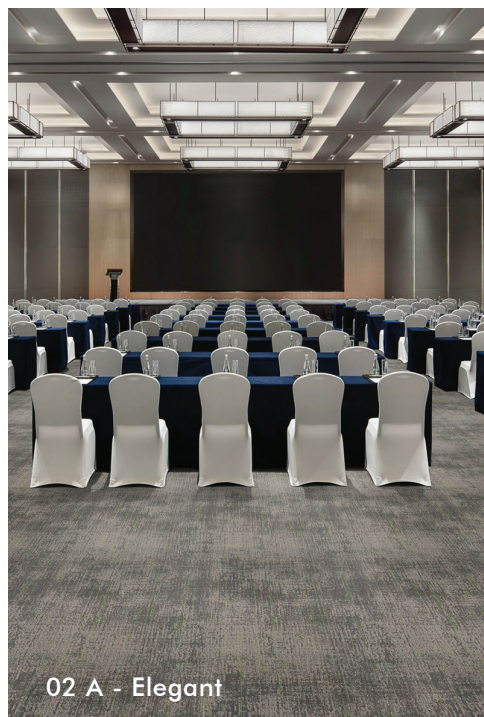
02 A - Elegant