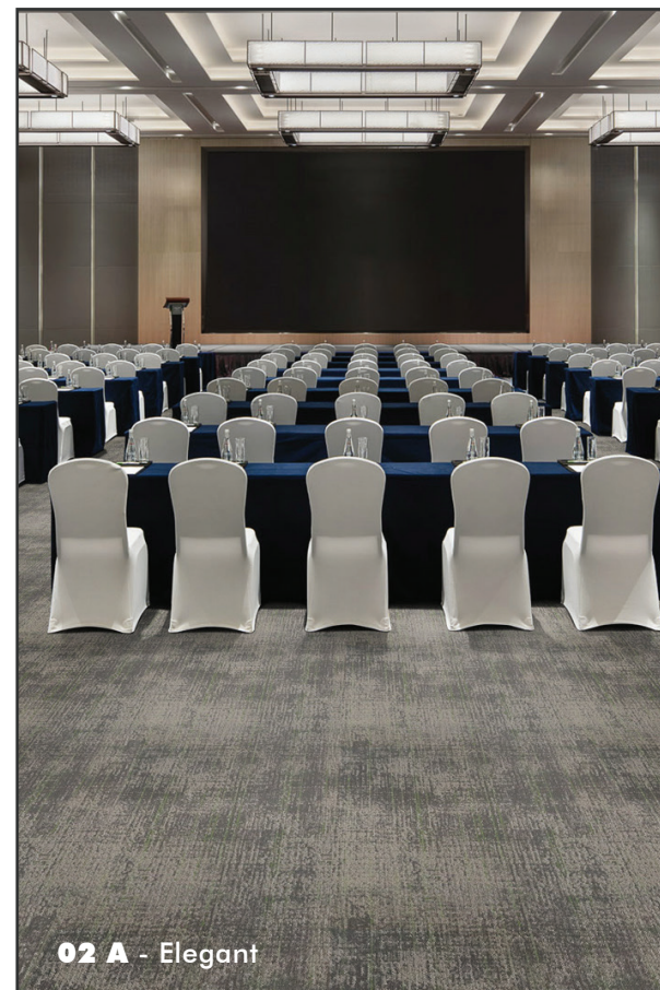
02 A - Elegant