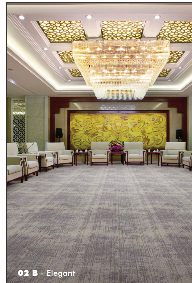
02 B - Elegant