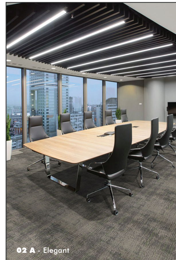
02 A - Elegant