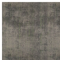
02 A Elegant