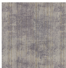
02 B Elegant