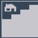
STAIRS CONTINUOUS USE